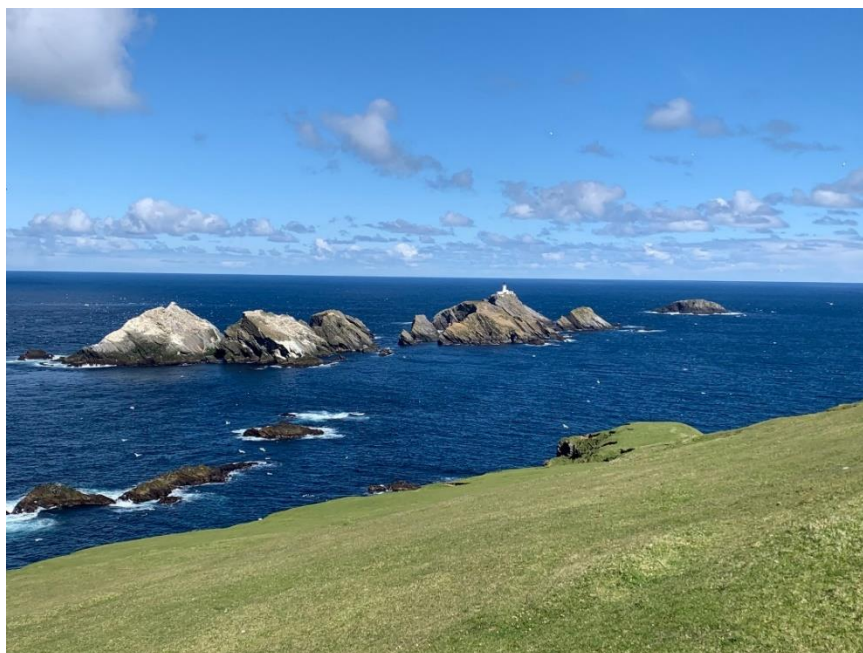
Muckle Flugga from Hermaness, Unst