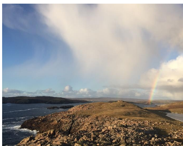
Broch of Culswick

Please note: Exact timings of sessions may be altered slightly and/or the order changed.